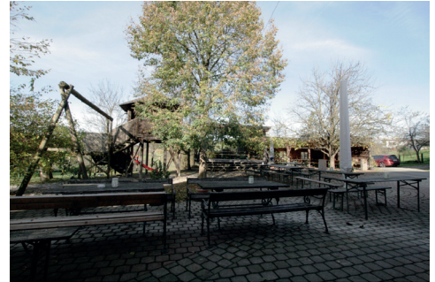
Outdoor dining area

Validity: October 2018, errors and omissions excepted