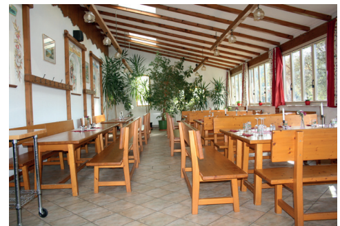
Guest room 2