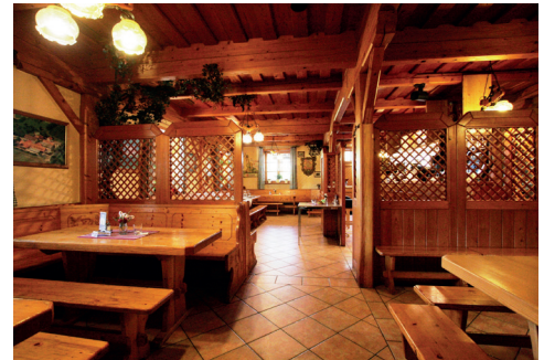
Guest room 1