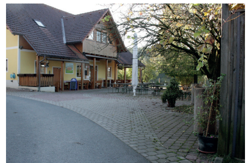
Access and accessible parking