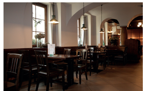
Tables with under-table wheelchair access